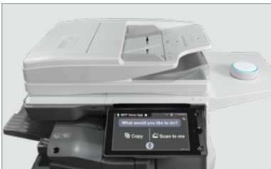
MX-M6051 shown with available Sharp MFP Voice feature with Alexa.