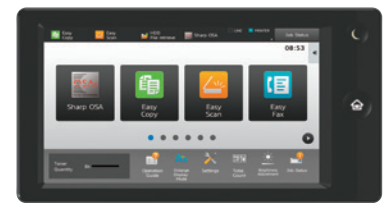
Award-winning 10.1" (diagonal) customizable touchscreen display.