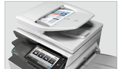
Sharp's ImageSEND™ feature provides one-touch distribution to email, cloud applications and more.