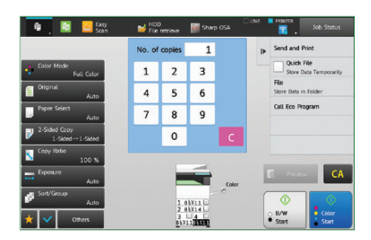
Standard Copy Screen offers more advanced features.