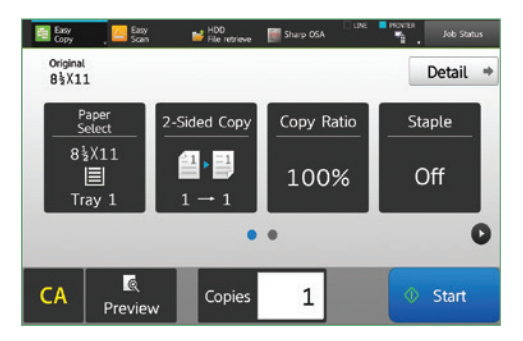
Easy Mode Copy Screen.