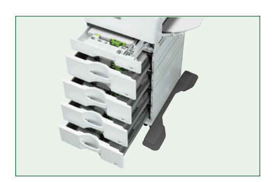
Both models offer up to six paper sources for a maximum 2,700-sheet capacity (shown with optional trays).