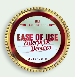
"PaceSetter Award in Ease of Use 2018–2019"