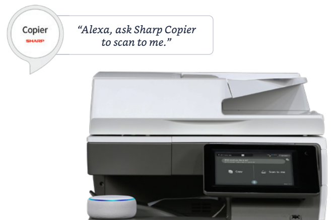
MX-C304W shown with available Sharp MFP Voice feature with Alexa.

Sharp has always been known for enhancing MFP productivity in the workplace by offering innovative, easy-to-use features. Sharp has done it again with the new MFP Voice feature available for color document systems. With Sharp's MFP Voice feature, you can interact with the machine just by using the power of natural language. With simple voice commands, you can ask the Sharp document system to make copies or scan a document.