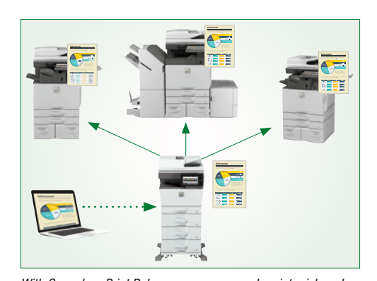
With Serverless Print Release you can securely print a job and release it from up to six Sharp MFPs (including host).