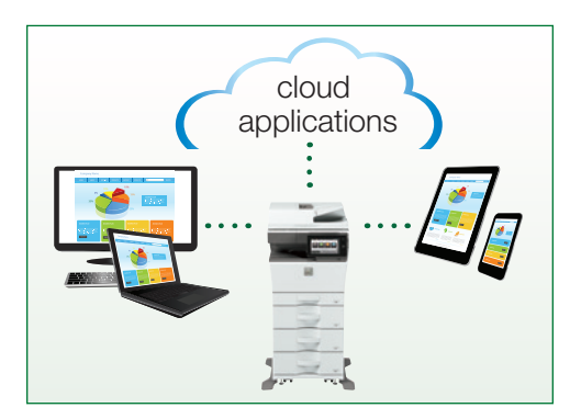
Distribute, access and print documents more easily.